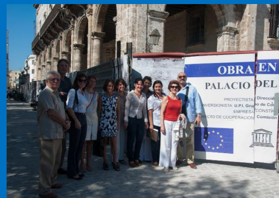
Visit of Androulla Vassiliou, Member of the EC, to Havana for the launch of the Erasmus+ programme

More detailed information can be accessed at: http://europa.eu/rapid/press-release_IP-14-122_en.htm